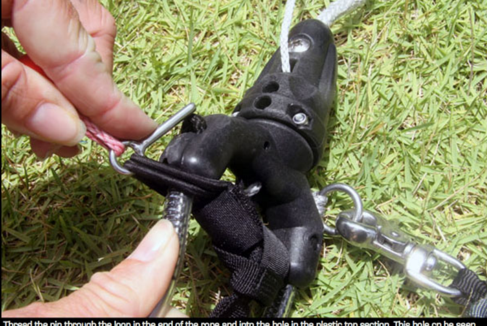
Thread the pin through the loop in the end of the rope and into the hole in the plastic top section. This hole can be seen in step 4.