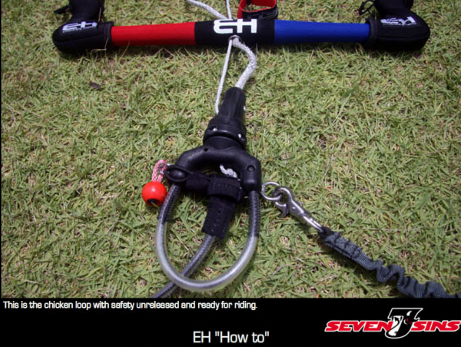
This is the chicken loop with safety unreleased and ready for riding.