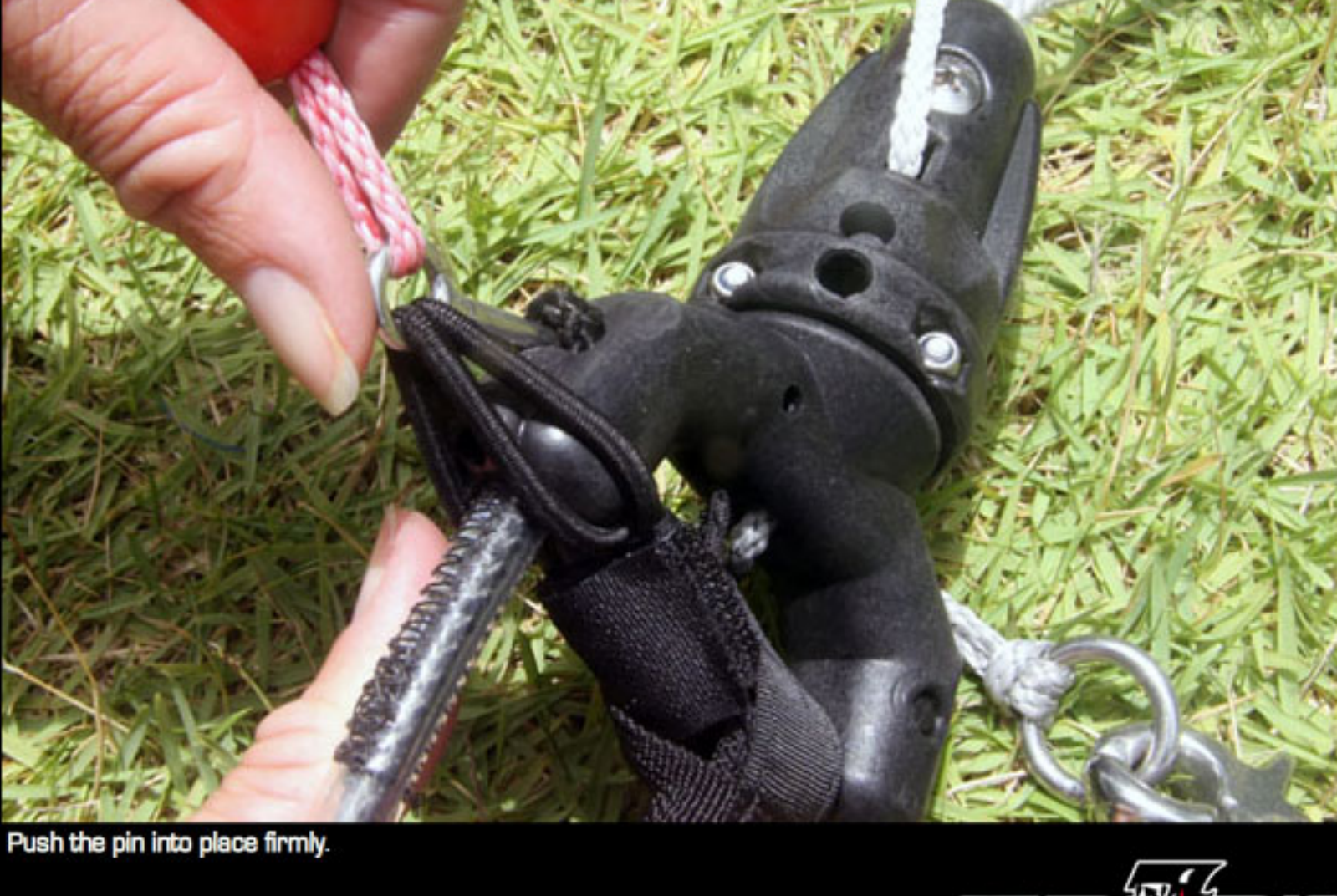
Push the pin into place firmly.