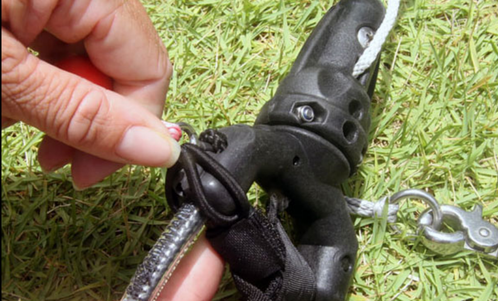
The chicken loop safety release is now reset and ready for action.