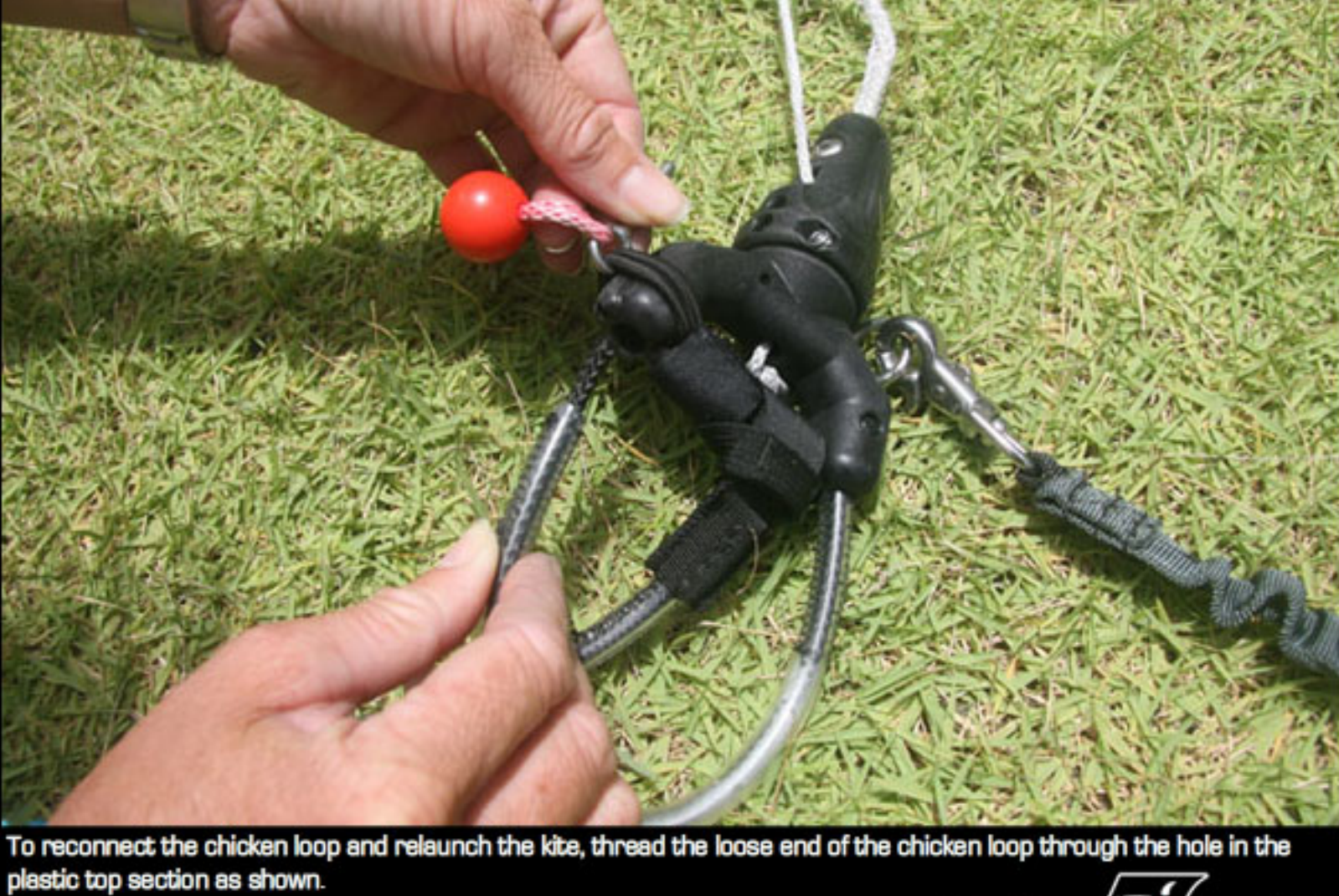
To reconnect the chicken loop and relaunch the kite, thread the loose end of the chicken loop through the hole in the plastic top section as shown.