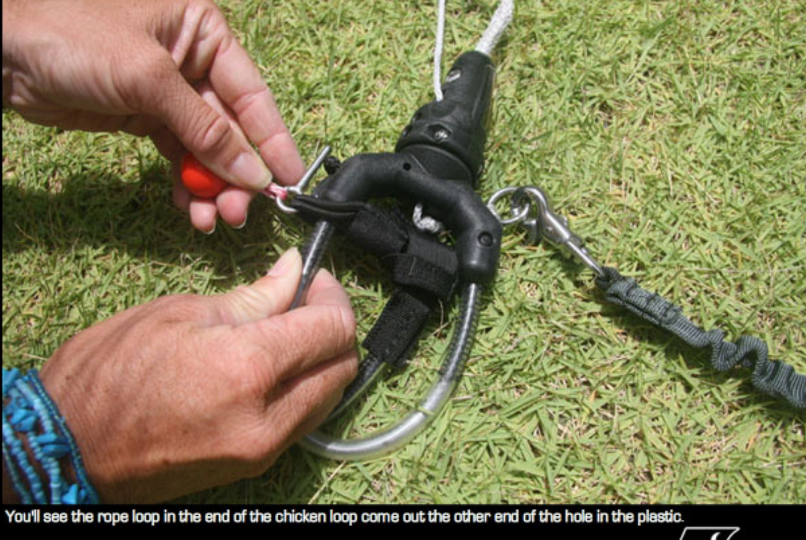
You'll see the rope loop in the end of the chicken loop come out the other end of the hole in the plastic.