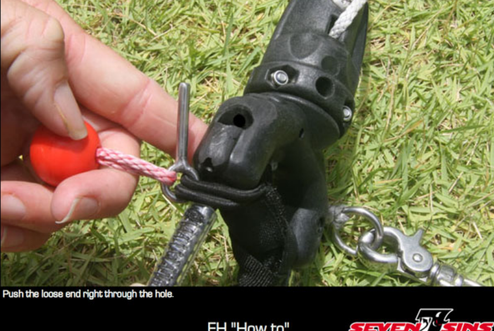
Push the loose end right through the hole.