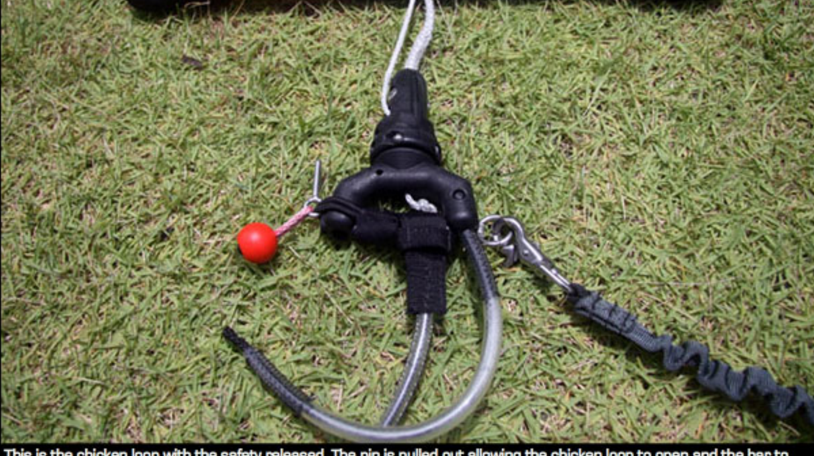
This is the chicken loop with the safety released. The pin is pulled out allowing the chicken loop to open and the bar to slide up the leash line killing the power of the kite.